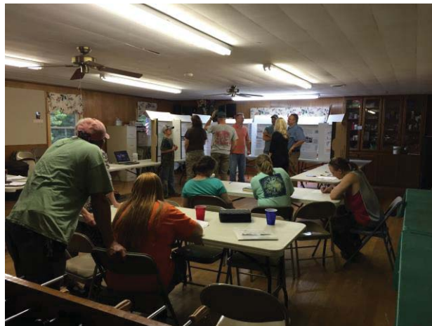
Sapphire Community Center, June 1, 2015

Results Summary: Biodiversity, community, tourism, health care and awareness, taxes, and regulations.